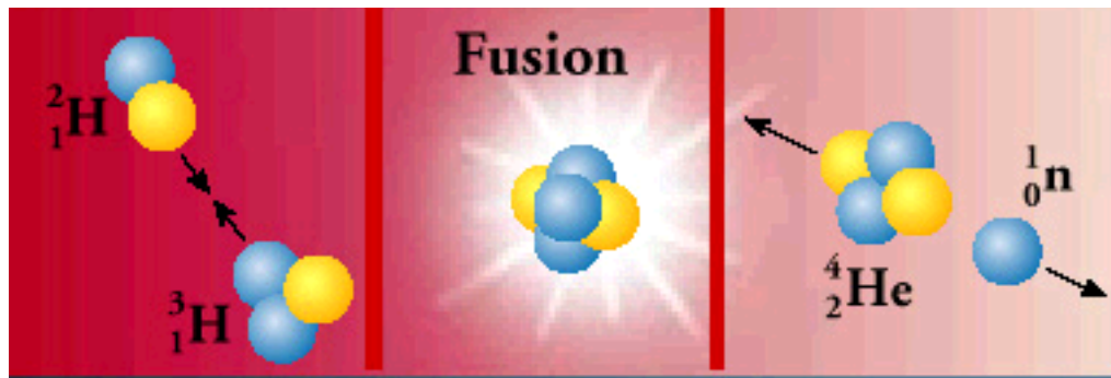
Fig. 14-3. A diagram showing a typical fusion reaction.

Nuclear fusion reactors, if they can be made to work, promise virtually unlimited power for the indefinite future. This is because the fuel, isotopes of hydrogen, is essentially unlimited on Earth. Efforts to control the fusion process and harness it to produce power have been underway in the United States and abroad for more than forty years.