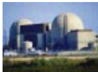
Fig. 14-2. The reactor vessel of a commercial reactor is inside this containment building.

undergoes thermal neutron fission with a high probability. Thus the “big three” readily fissionable nuclei are ^{235}\text{U} , ^{239}\text{Pu} , and ^{233}\text{U} .