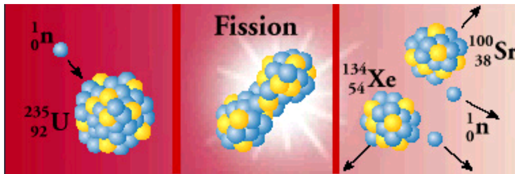
Fig. 14-1. Fission of ^{235}\text{U} after absorption of a thermal neutron.

The relevant nuclear reactions can be written as follows: