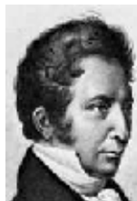
Joseph-Louis Gay-Lussac (1778-1850) Paris, France, 1800