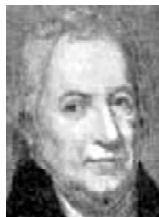
Claude-Louis Berthollet (1748-1822) Paris, France, 1778