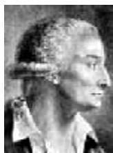
Antoine-Laurent Lavoisier (1743-1794) Paris, France, 1764 FATHER OF MODERN CHEMISTRY