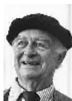
Linus C. Pauling (1901-1994) Pasadena, California, 1925 NOBEL PRIZE (CHEM), 1954 NOBEL PRIZE (PEACE), 1962