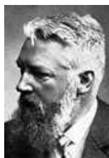
F. Wilhelm Ostwald (1853-1932) Dorpat, Latvia, 1878 NOBEL PRIZE (CHEM), 1909