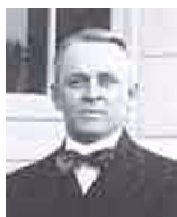
Arthur A. Noyes (1866-1936) Leipzig, Germany, 1890