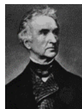
Justus von Liebig (1803-1873) Erlangen, Germany, 1822